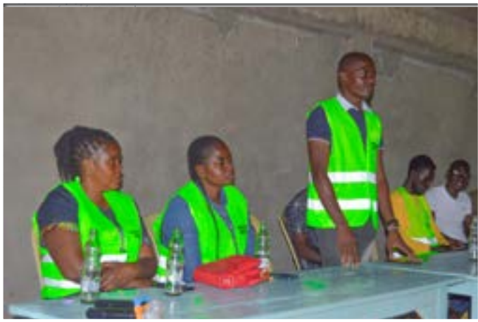
Kisumu MSEA team sensitizing MSEs during the tree-planting event

MSEA officers took the opportunity to sensitize youths on the opportunities available in the authority, in government, as well as the authority’s key services. The tree planting exercise was part of the National Tree Planting Campaign under the Presidential Program for Accelerated Restoration of Forests that aims to plant 15 billion trees by 2032.