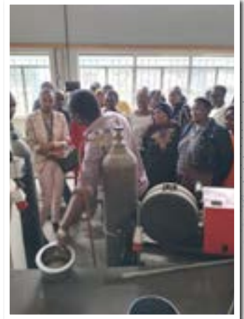
KIRDI team demonstrating the use of some of the machines at the Centre