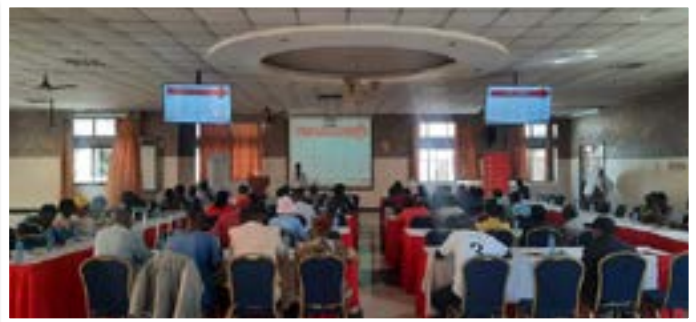
Stakeholders listening in during the sensitization on tax compliance