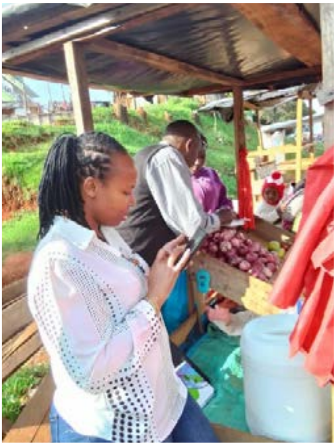
MSEA and KIBT officers undertaking needs assessments in Nyeri County

As a result, the MSEA Nyeri office successfully negotiated with the KIBT Regional office, securing a first-priority position once the enhanced curriculum is rolled out.