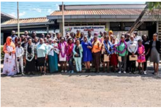
Participants and MSEA Kariobangi Centre of Excellence officers at the closing ceremony