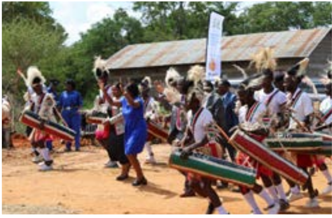
Embu County Governor, Her Excellency Hon. Cecily Mbarire accompanied by Cabinet Secretary for Industry Trade and Investment Hon. Rebecca Miano and other national and county officials arriving at the ceremony

A model of the aggregation and industrial park displayed at the groundbreaking ceremony