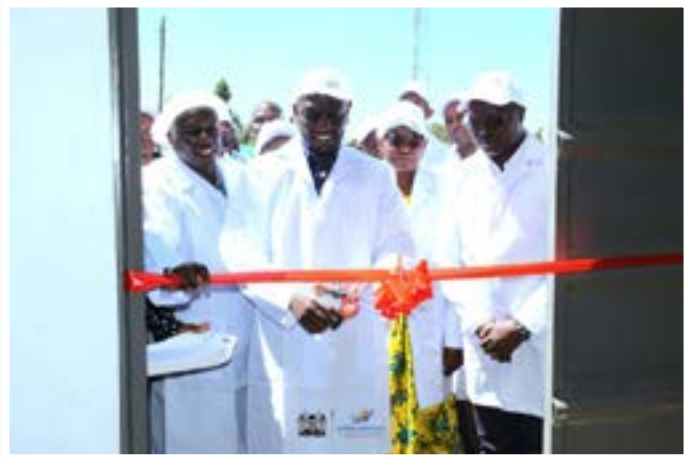
President Dr. William Ruto accompanied by the Deputy President H.E Rigathi Gachagua, Cabinet Secretary Ministry of Co-operatives and MSMEs Development Hon. Simon Chelugui officially opening the Ngusishi Cold Storage Facility in Meru County