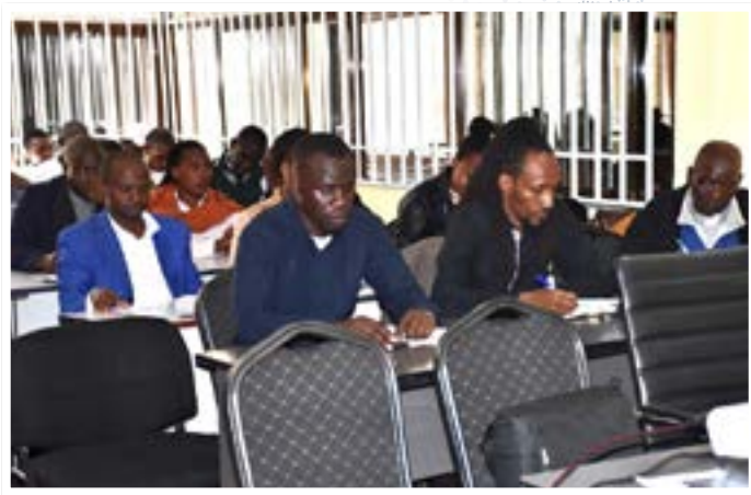
Participants at the Inaugural Co-learning and Co-sharing Day