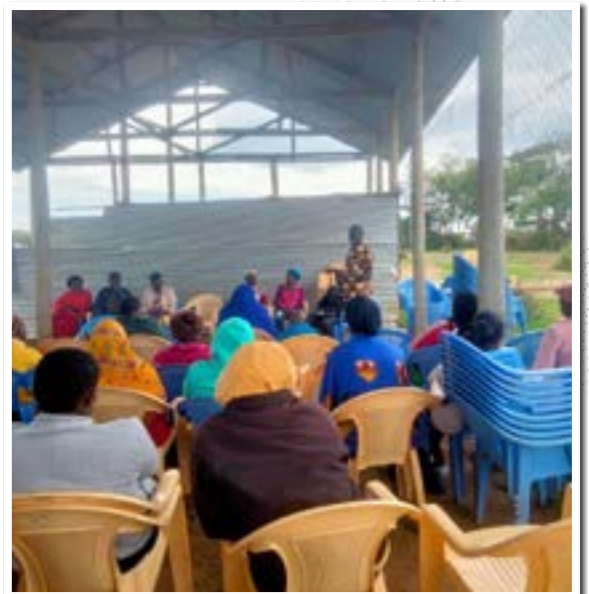
MSEA Laikipia Office sensitizing Segera Umoja Chicken Farmers' Cooperative Society at the forum