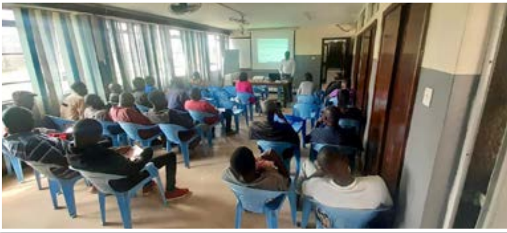
Workshop Safety training conducted by MSEA Officer in Kariobangi Centre of Excellence

MSEs were reminded of their inherent responsibility in maintaining a safe work environment and encouraged to actively participate in hazard identification, promptly report potential risks, and diligently adhere to safety protocols and regulations.