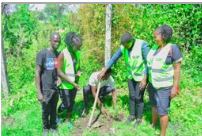
The team preparing to plant the tree at Nyakach CIDC