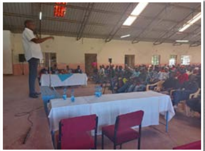
Highlights from the sensitization and awareness campaign on the National Affordable Housing Project in Laikipia County