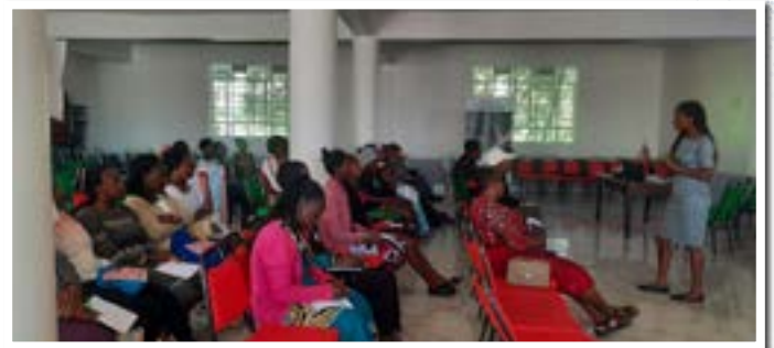
MSEA officer sensitizing MSEs at an entrepreneurship-training program in Nakuru

As a positive outcome, the MSEs have collectively decided to establish an association and officially register with MSEA.