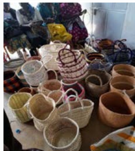
Baking oven used at Ikombe Centre