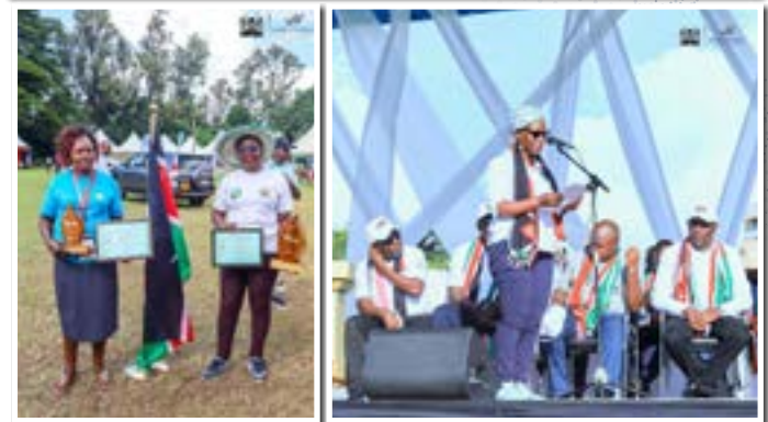
Scenes from the 23rd EAC MSMEs Trade Fair in Bujumbura, Burundi