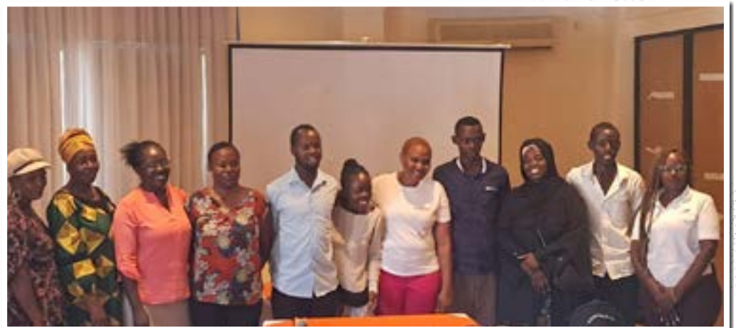
MSEA Mombasa regional office during the election of officials for the Pwani Circular Association, which focuses on waste management in Mombasa.