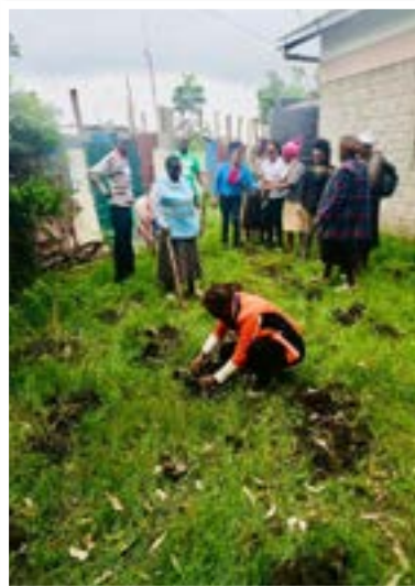
MSEA Nairobi officers participating in the tree planting exercise