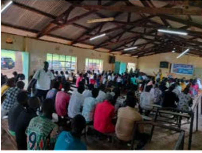
Igoji youth gaining skills and insights at the event