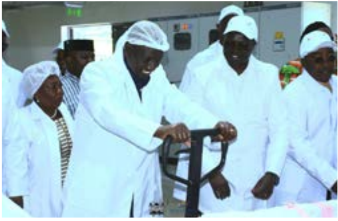
His Excellency, the President, demonstrating the use of equipment at the cold storage facility.