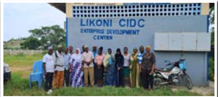
MSEA Mombasa team together with Likoni Bubumbu Jua Kali Association members during the visit