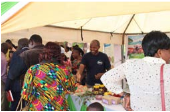
Embu County Governor, Her Excellency Hon. Cecily Mbarire accompanied by Cabinet Secretary for Industry Trade and Investment Hon. Rebecca Miano and other national and county officials visiting MSE stands at the event