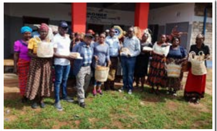
Weaving baskets done by the MSEs at Ikombe Centre

The support provided by MSEA Machakos regional office will go a long way in unlocking the potential of the Ikombe MSEs and driving socio-economic development in the community.