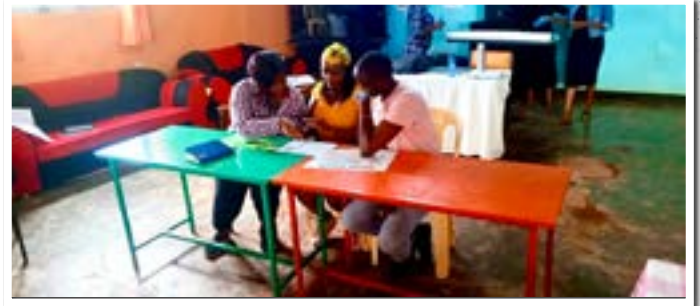
MSEA Nyeri Office, in partnership with Enable Youth Association and ILO, during a four-day business management skills training using the SYIB business-training module