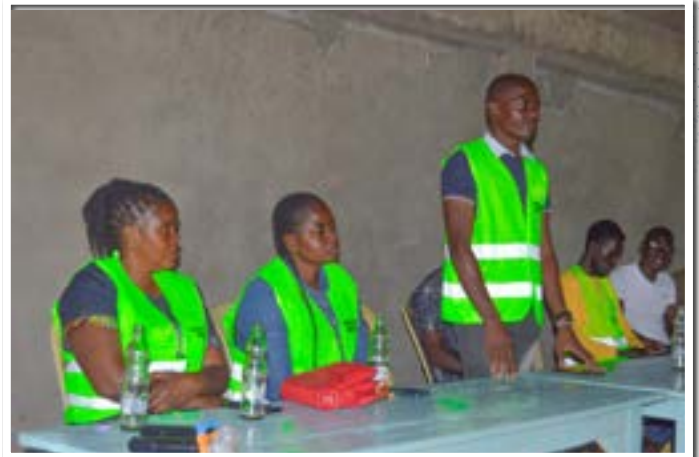
MSEA Kisumu team participating in the tree planting exercise