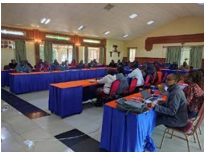
Training session at the export readiness forum in Elgeyo Marakwet

The session was a revelation since it helped MSEs to understand the importance of exporting and its challenges. In attendance were the CEC Trade, CEC Devolution and ICT, CO Trade, Director for Co-operative, Director Trade, and County Cooperative Officers. The KenTrade portal enlightens the traders on the requirements that a trader needs in order to export their goods, all the institutions, and the certificates needed. It also provides the statistics for all the products that are exported from Kenya and to what country.