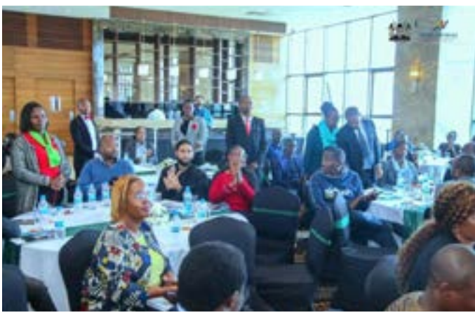
Highlights from the partnership launch