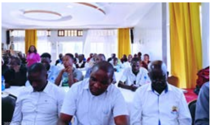
MSEs participating at the training session in Othaya