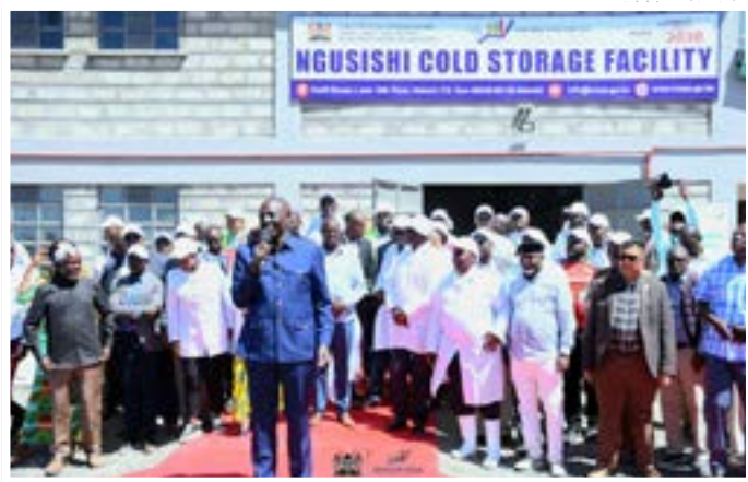
H.E President William Ruto speaking during the launch of Ngusishi Cold Storage Facility in Meru County