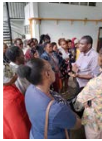
KIRDI team having an interactive sessions with the MSEs

This collaborative learning experience not only strengthens their skills but also aligns with broader goals of promoting sustainable business development practices.