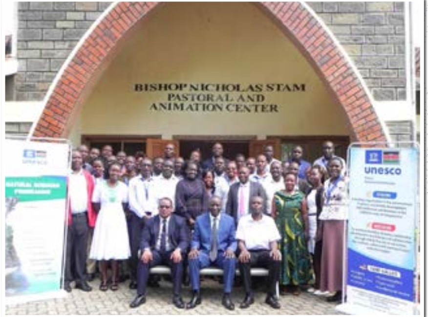
Participants at the capacity building workshop for TVET Trainers in Western Kenya