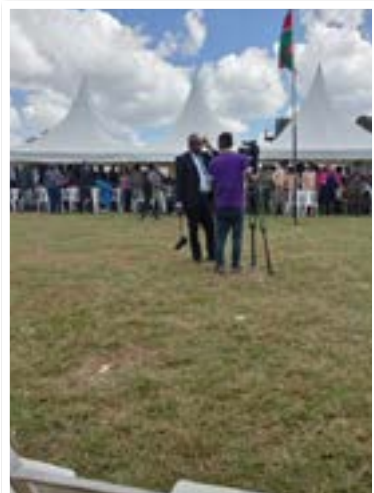
MSEA Nakuru office took part in the ongoing public participation on affordable housing at Bahati constituency, Bahati stadium