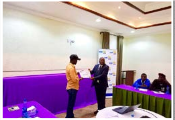
MSEs participating in the engagement forum

This exemption directly contributes to a reduction in production costs for the cross-border MSEs. Furthermore, participants were informed about the Common List of Products that fall under the purview of the STR. Lastly, the MSEs were educated on the process for obtaining the Simplified Certificate of Origin (SCOO), which is vital for availing the benefits provided by the STR.