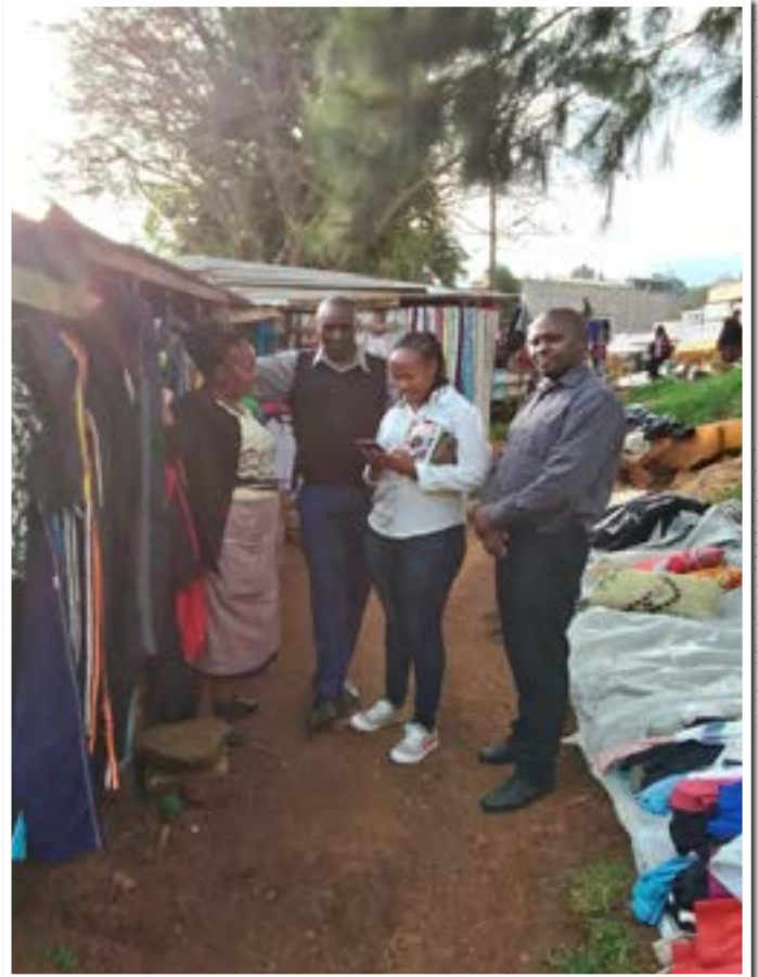
MSEA and KIBT officers undertaking needs assessments