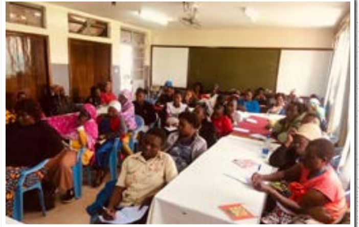
MSEA Kariobangi team and Pendekezo Letu NGO during the sensitization forum aimed to empower 39 MSEs from various sub-counties within Nairobi County