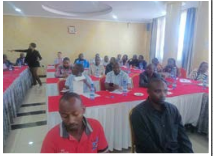
Participants at the DUAL-TVET training program