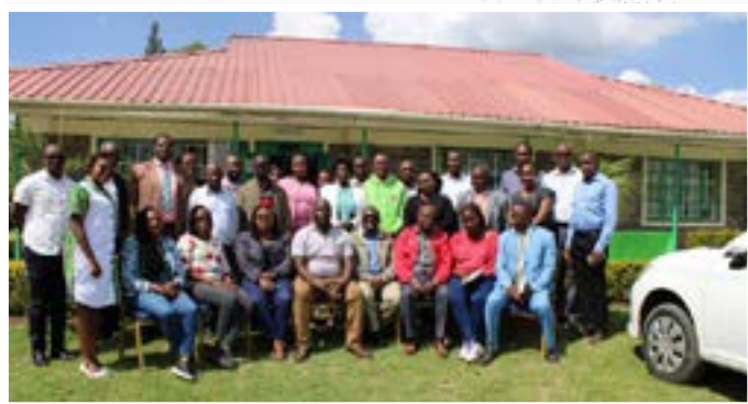
MSEA Nyandarua office, Nyandarua County MCAs, and National Agricultural Value Chain Development Project (NAVCDP) team members during the training.