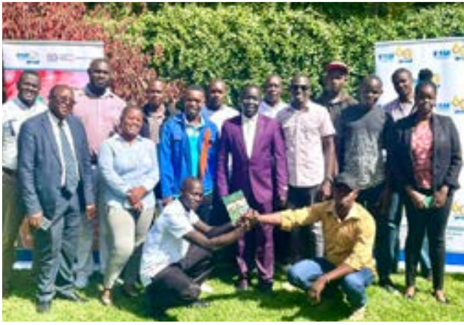
Stakeholders during the sensitization of the graduates of the East African Institute of Welding in Lodwar