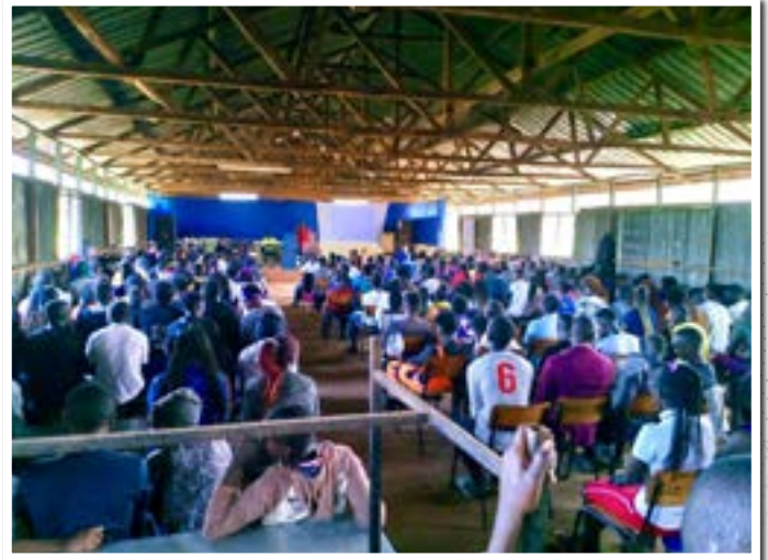
The MSEA Meru regional office during the youth mentorship forum at Kianjai Girls Secondary School