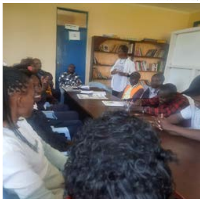
The MSEA Meru Regional Office and representatives from the Kenya Revenue Authority during the sensitization and registration of group associations at Karma Technical Institute in Urru area in Tigania East Constituency