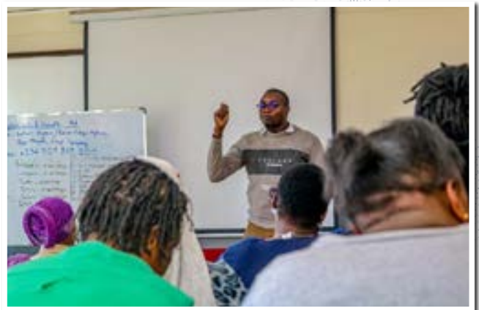
MSEA officer interacting with the MSEs at the closing ceremony