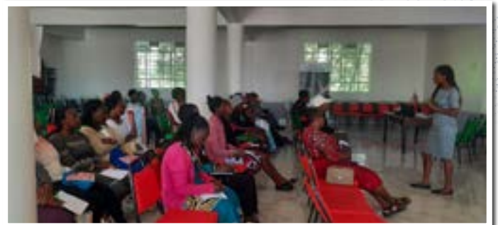
MSEs posing with their certificate after the 2-day entrepreneurship-training program