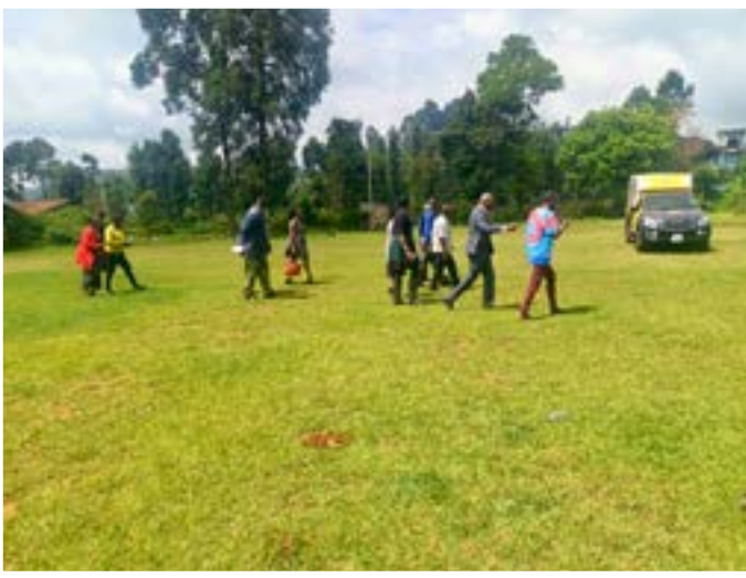
MSEA Embu office together with County Director of Housing, County Co-ordinator National Land Commission, County Land Surveyor, County Land Administrator, County Land Adjudication Officer, County civil engineer, NEMA, KPLC, County police boss and the CIC during the site visits