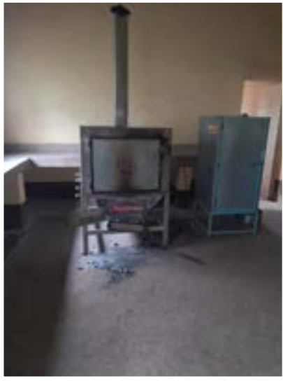
Baking oven used at Ikombe Centre

follow-ups will be made with all stakeholders to discuss end to end operationalization model towards implementation of the projects which will be done in pilot phases.