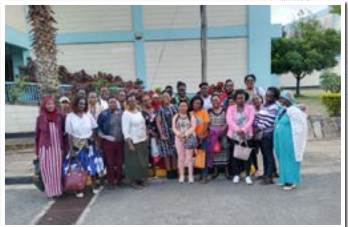
MSEA Kariobangi team and MSEs that attended the Benchmarking Exercise