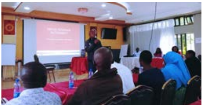
MSEA Nyeri Office and KRA team leading the training session

KRA covered several topics including; the need for entrepreneurs to understand value-added tax (VAT), the need for a comprehensive understanding of eTIMs, its adoption, implementation, and implications on businesses and the need to file returns, etc. The MSEs were encouraged by the KRA officers to fully adopt eTIMs and by doing so they will be shaping the future of taxation.