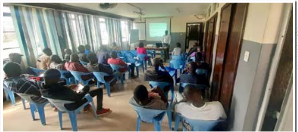
Workshop Safety training conducted for MSEs at Kariobangi COE