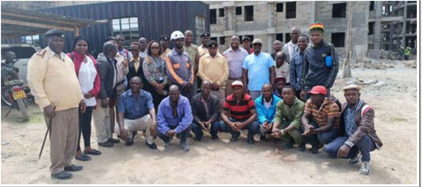
MSEA Nairobi Region and Registrar’s office, a team from the State Department of Housing, Area Chiefs, and MSEs representatives during the MSE sensitization and registration at Mukuru Slum Upgrading Project