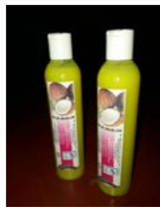
Smart Ventures products on display