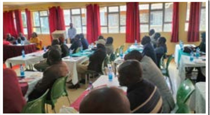
MSEs participating at the workshop organized by MSEA and Insurance Regulatory Authority