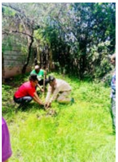
MSEA Nairobi Head Janet Kamotho at the tree planting exercise

A total of 110 trees were planted as part of the Presidential Program for Accelerated Restoration of Forests.