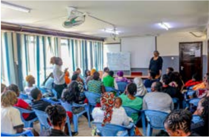
MSEs having an interactive session at the closing ceremony