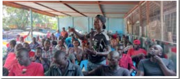
Youth at the sensitization forum participating at the training