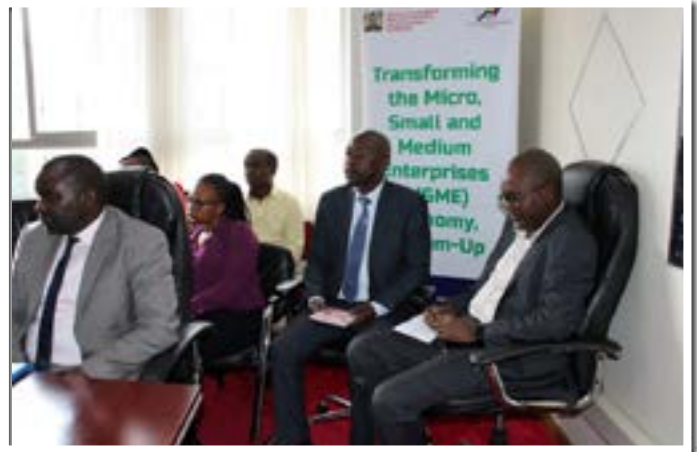
Staff members present at the meeting held at MSEA Board Room