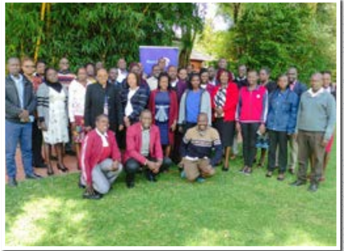
Participants at the export readiness training in Elgeyo Marakwet