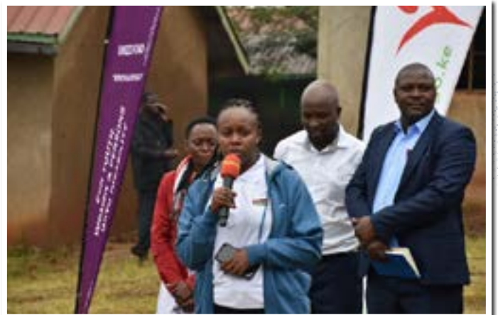
Highlights from the Sensitization on Economic Empowerment and Registration of MSMEs in Busia