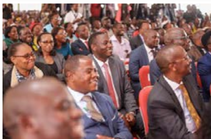
Highlights from the hustler fund anniversary celebrations