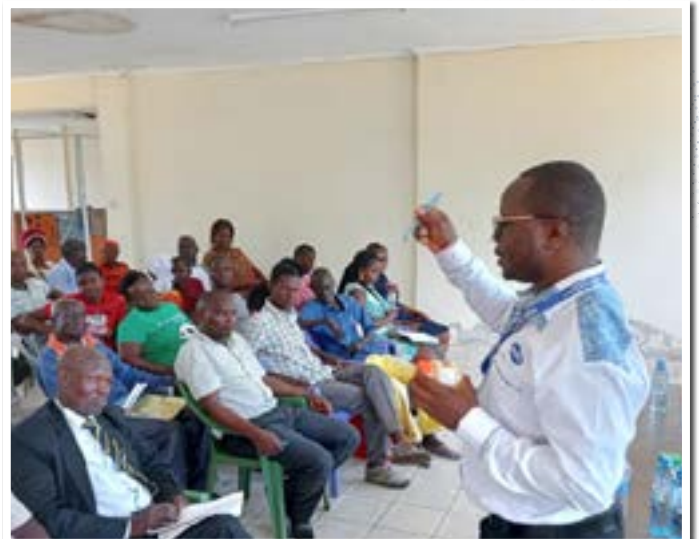
KEBS officers training the MSEs at the workshop