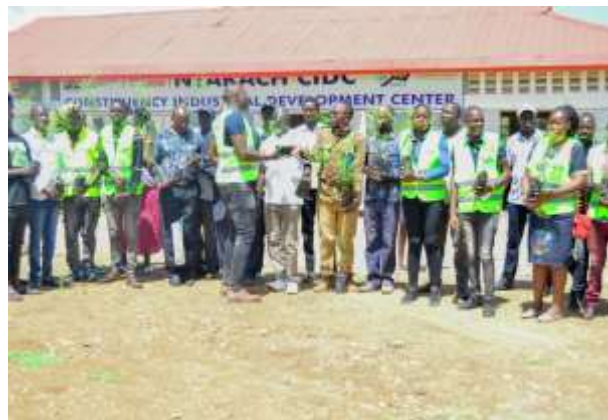
MSEA Kisumu team participating in the tree planting exercise at Nyakach CIDC Tree Planting Initiative in Bungoma