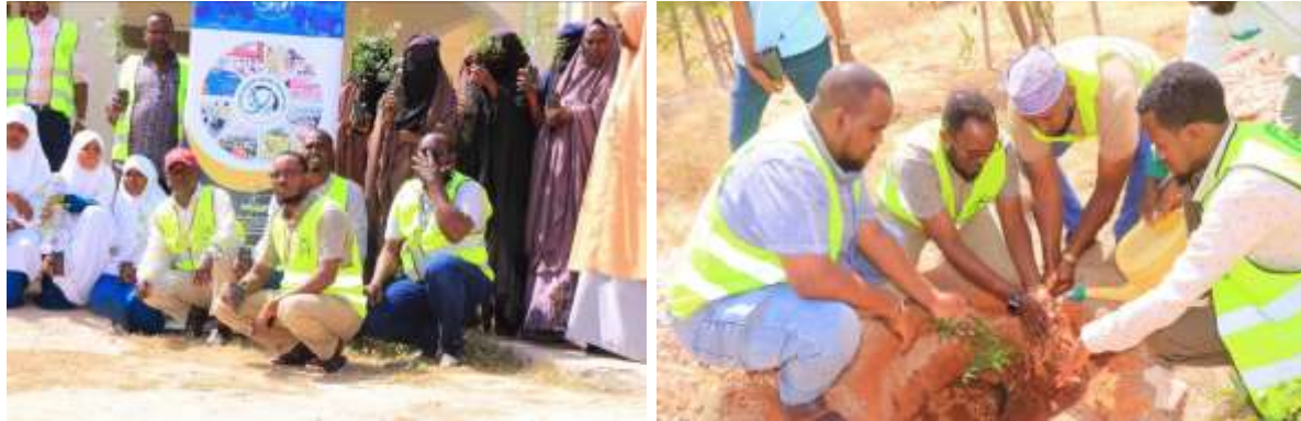
Highlights from the tree planting activities in Mandera County

In Mandera County, the MSEA partnered with Elwak Municipality, Elwak South youth, and Darul Hikma Secondary School for a tree planting exercise. This collaboration highlights the importance of community involvement in environmental conservation efforts.