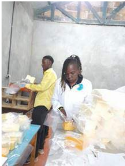
MSEs at the MSEA Agro-processing facility showcasing the processed cheese products