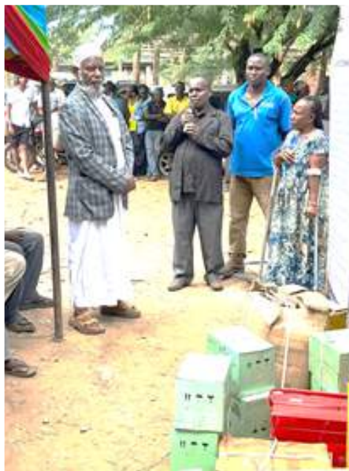
Malindi MSE Association and Malindi Artisan Association members