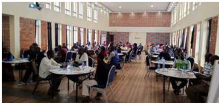
Highlights from the three-day sensitization workshop in Busia.