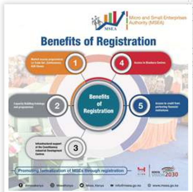
Campaign to sensitize the public on MSE Registration

The campaign aims to inform and educate the Authority's stakeholders about the registration process and also encourage more micro and small enterprises and association to register. Displayed below are some of the campaign posters;