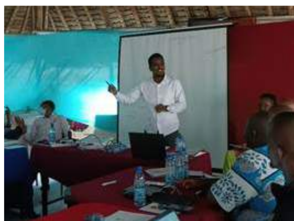
Workshop on the Kenya MSE Policy 2020 in Garissa County