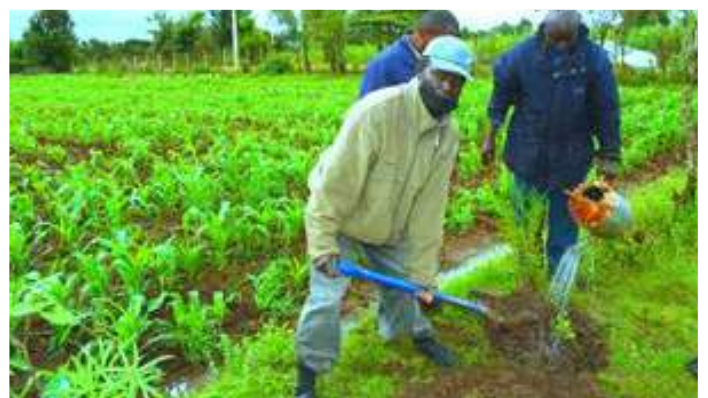
MSEs participating in tree planting at the Sipili CIDC