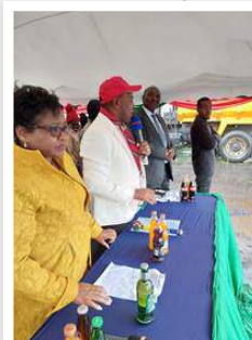
Members of the Ol-kalou digital Juakali association and sample machines they received