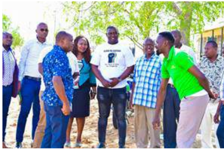
Breakout sessions during the youth empowerment sessions