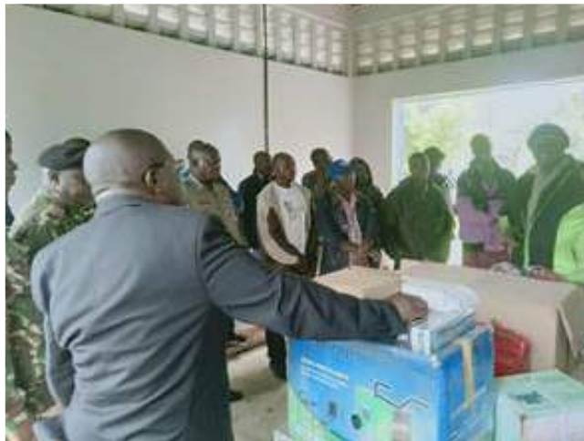
Machine distribution in Khwisero CIDC, Luanda CIDC and Mumias CIDC in Kakamega County.