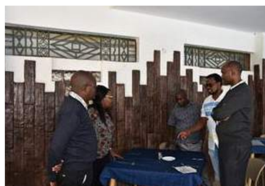
Guided discussion forums during the workshop