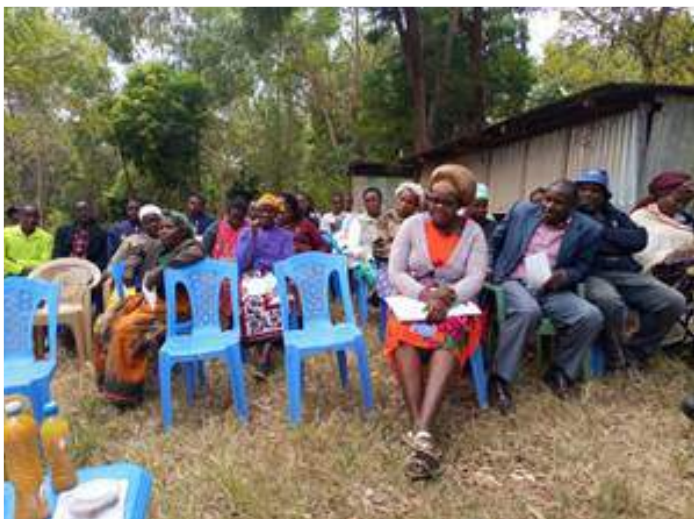
A representative from Stima Sacco training MSEs on financial and non-financial business aspects in Mbeere