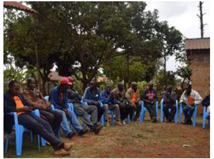
Members of Kiirugu-Thigaa Boda Boda Association showcasing their fueling station at Maara