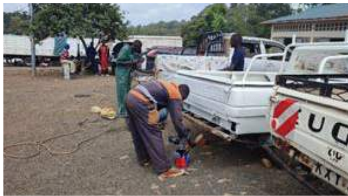
Kitale Micro and Small Enterprises Auto Garage, MSEs working on clients' vehicles.

The machines handed over included; Universal Vehicle Diagnostic Kit, Mig 205 welding machine, Oxy-ace trine welding set- 1 pc, ARC Welding machine 400a, Woodwork router/moulder, Complete Mechanical tool Kit, Bench Vice 6"-2pcs and Grinders 6" - 2pcs Assorted Consumables.