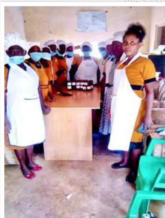
Members of the Kambu fruits value chain group and sample jam made from baobab