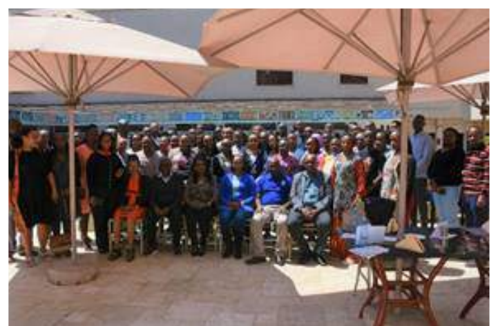
MSEA staff during the KYEOP component 2 review workshop.